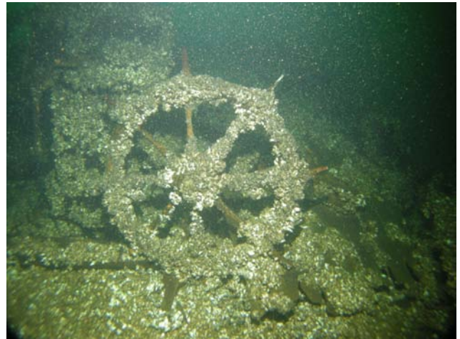
Ships Wheel City of Sheboygan

Routine for the day is finish breakfast and leave for the boat around 7:30 AM. Load the gear and leave the dock around 8:30 AM. Do the two dives. Back to the dock around 1PM get the tanks refilled, then a nap and out for dinner. Rinse and Repeat. Sunday afternoon dry the gear, and get a good nights sleep for the drive home..