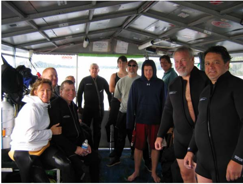
2008 Club Trip to Brockville Ontario Canada